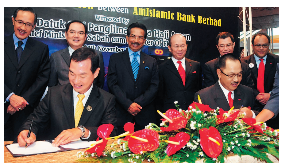
The signing between AmIslamic Bank Berhad and Sabah Credit Corporation of RM100.0 million Islamic Banking Facilities Agreement which took place in Kota Kinabalu on 24 November 2010.