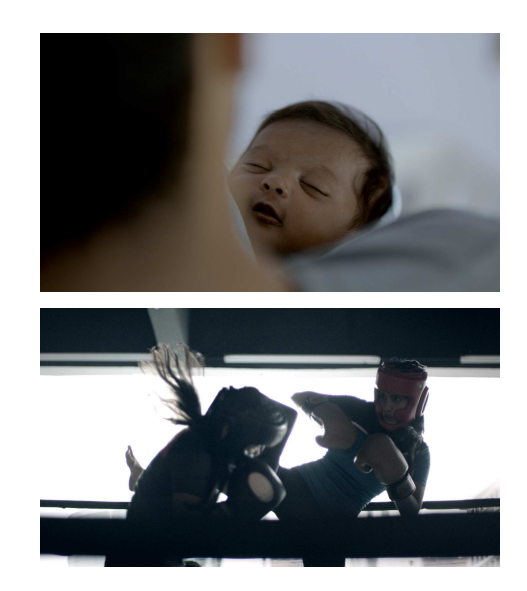
Still images from the new AmMetLife "Live Ready" TV Commercial

A teaser newspaper advertisement will appear on 11 August.