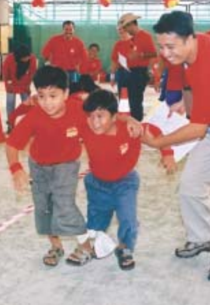
Three-legged race for children at the Region 2 Family Day, Ipoh.

The Kelab AmBank Group treasure hunters before flag-off at the National Science Centre, Bukit Kiara.