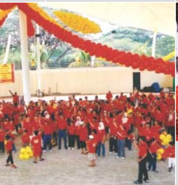
Strong support from staff and family members at the Region 2 Family Day, Ipoh.