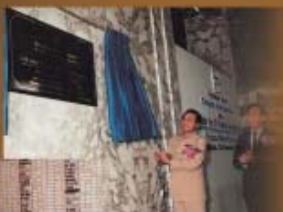
AMFB launches unique service for children