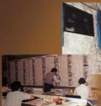
Another first for Arab-Malaysian Merchant Bank - acquired majority interest in a stockbroking firm