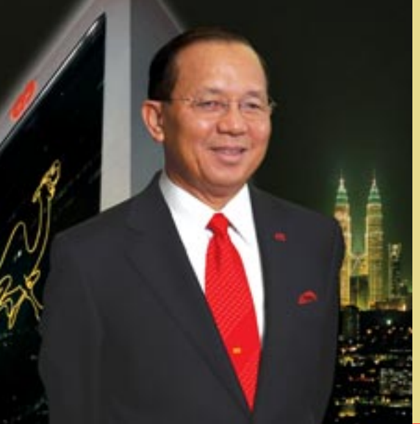
16 Chairman's Statement AmMerchant Bank Group improved its profit before tax by 14.5% to RM193.2 million...