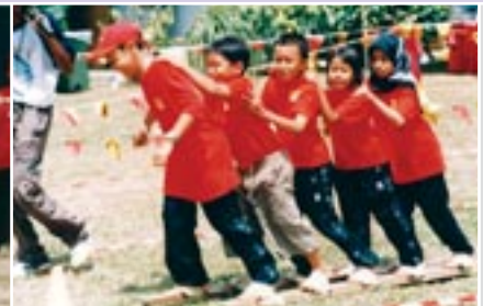
▲ Children (above) and staff (left) having fun at AmBank Group's Region 5 Family Day, Kuantan.