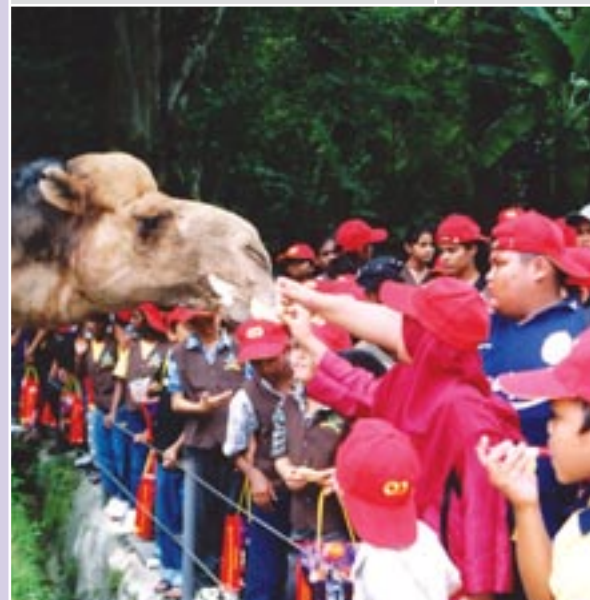
▼ Underprivileged children having fun with a camel at the Kelab AmBank Group trip to Zoo Negara.