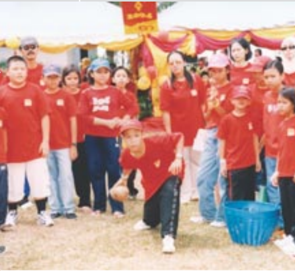
▲ Children's coconut bowling at the Region 5 Family Day, Kuantan.