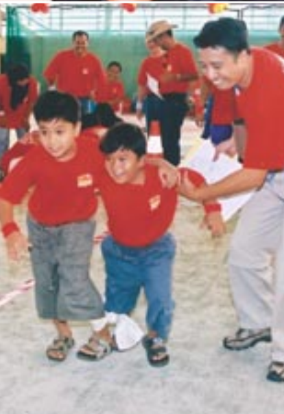
Three-legged race for children at the Region 2 Family Day, Ipoh.

Strong support from staff and family members at the Region 2 Family Day, Ipoh.