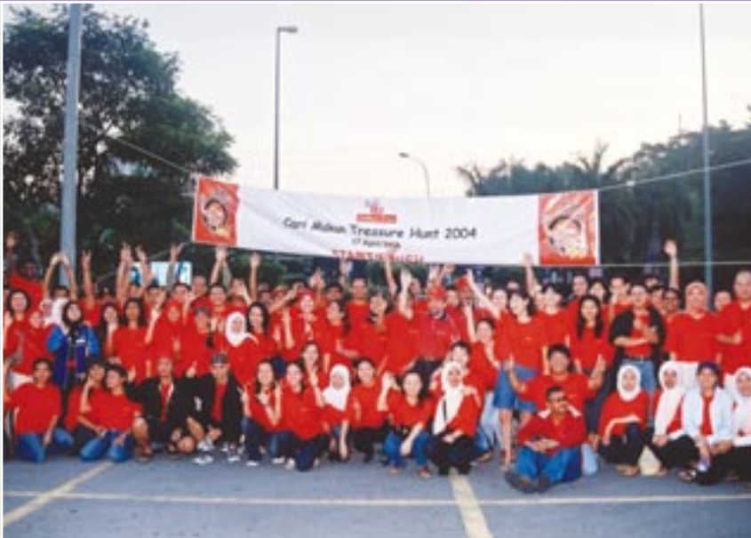
◀ The Kelab AmBank Group treasure hunters before flag-off at the National Science Centre, Bukit Kiara.